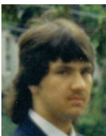
Alcoholic at 16