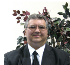
Clear and free since 1999

Jesus Christ brought Deliverance from every bondage!