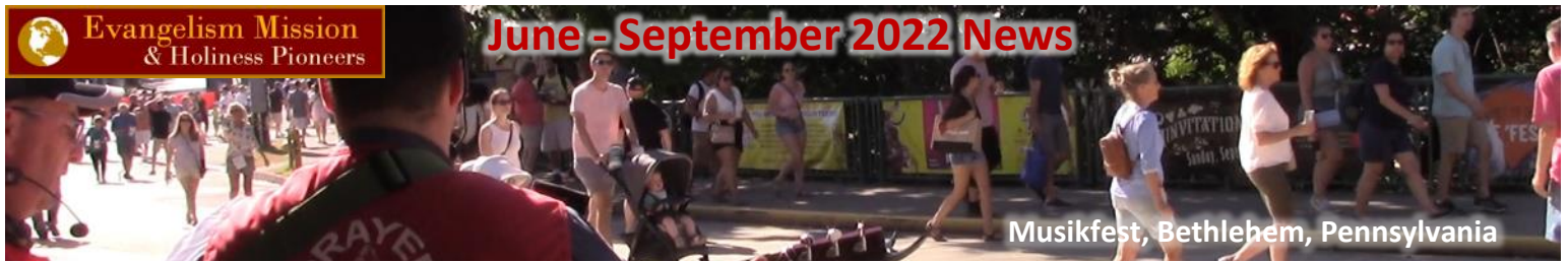
Musikfest, Bethlehem, Pennsylvania